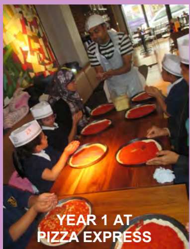
YEAR 1 AT PIZZA EXPRESS