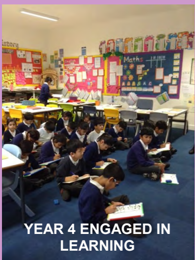
YEAR 4 ENGAGED IN LEARNING