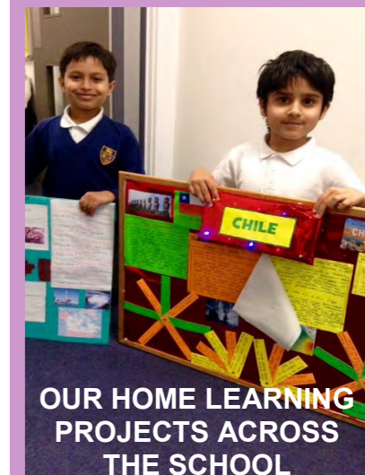
OUR HOME LEARNING PROJECTS ACROSS THE SCHOOL